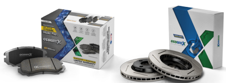
Brake System Parts: Brake Pads & Brake Disc Rotors.