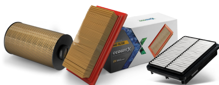
Filters: Oil Filters, Air Filters, and Fuel Filters & Cabin Filters for Passenger & Commercial Vehicles.