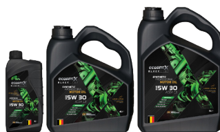
Lubricants & Maintenance: Motor Oil, Transmission Fluid & ATF, Brake Fluid, Antifreeze & Coolant.