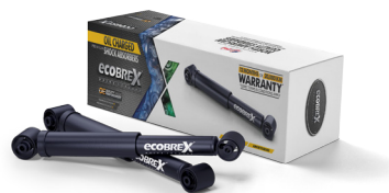
Shocks & Struts: Shock Absorbers For Passenger Cars & Trucks, Struts.